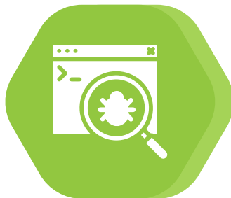
QA & Testing