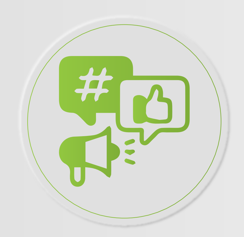
Social Media Marketing